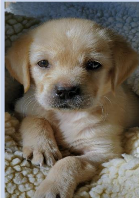
Murray as a puppy